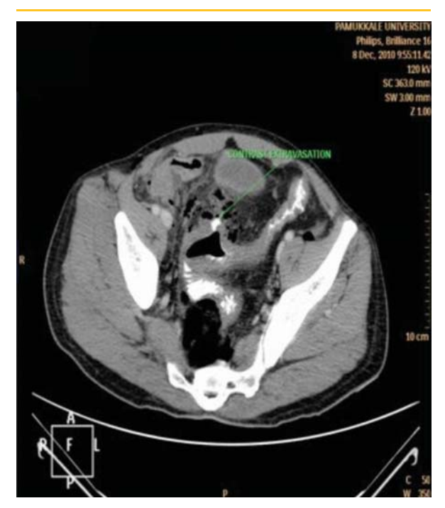
Figure 3. CT demonstrate late perforation.

Laparotomy revealed that the perforation site was at the rectosigmoid junction (Fig. 4). Since rectovesical fossa filled with pus, Hartmann surgery preferred due to the