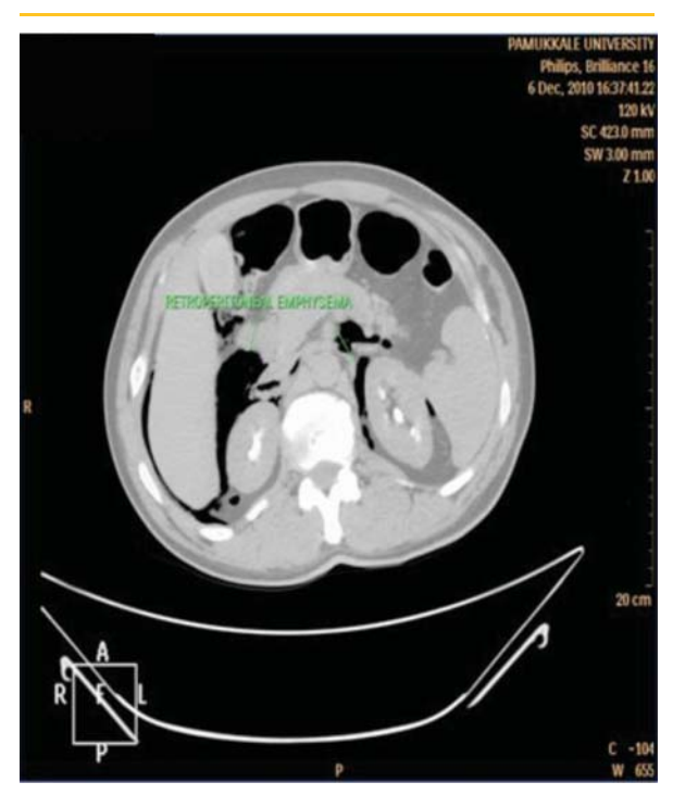
Figure 1. CT demonstrate retroperitoneal free air.

Physical examination revealed emphysema in the neck and chest, patient's voice was changed, his face was swollen and had abdominal distention and discomfort without tenderness and signs of peritonitis. White blood cell (WBC) count was 7000/ml. Upright plain abdominal and chest X-ray films were normal. Contrasted computed tomography (CT) (with both oral and rectal routes) examination revealed large amount of air in the retroperitoneal space but no signs of peritoneal perforation and substantial retroperitoneal perforation (Fig.1).